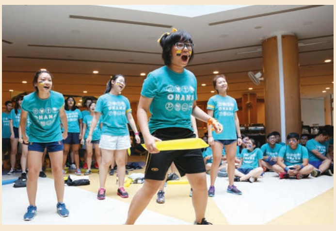
Yellow House practicing cheers