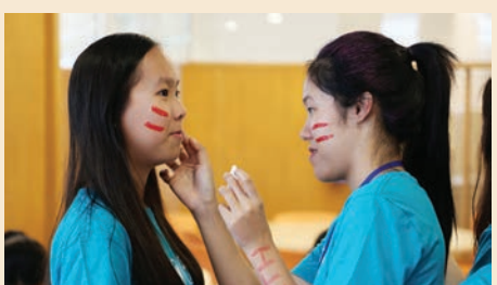
Helping a fellow house member face-paint