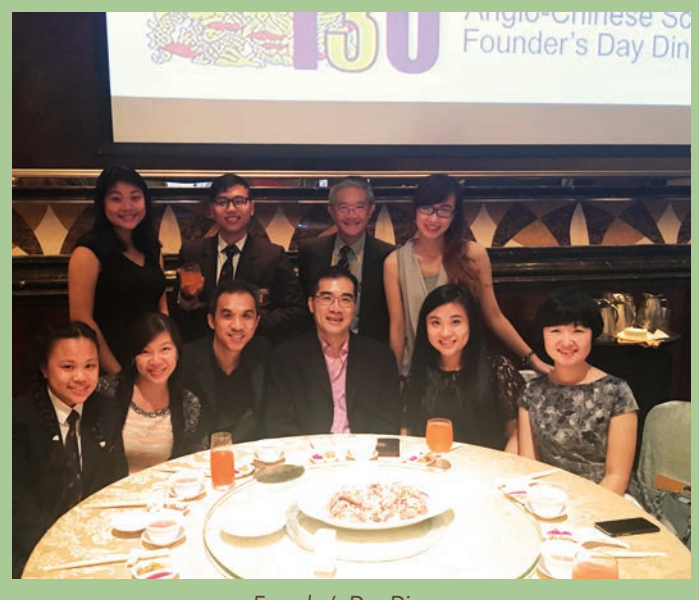
Founder's Day Dinner