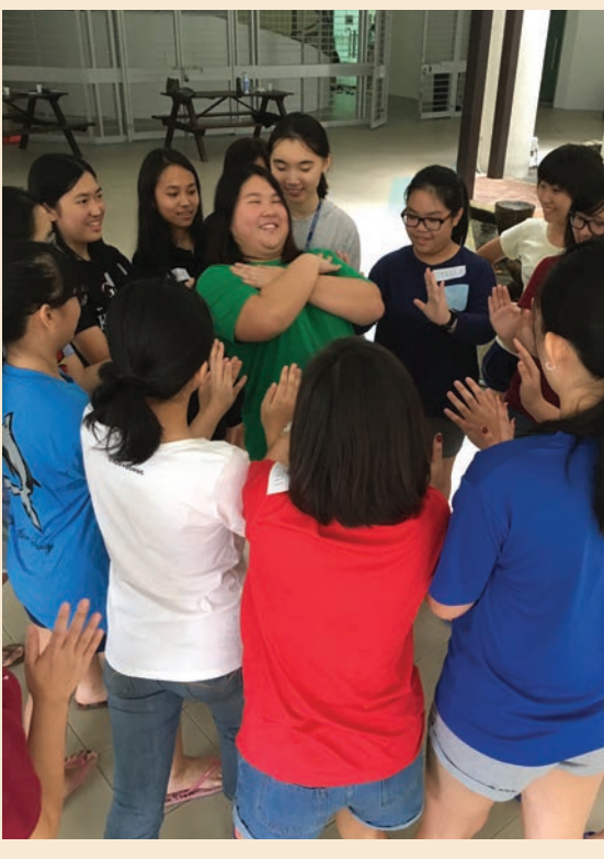
Boarders participating in the leaning game