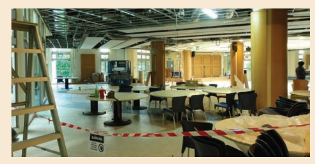
Renovations in progress